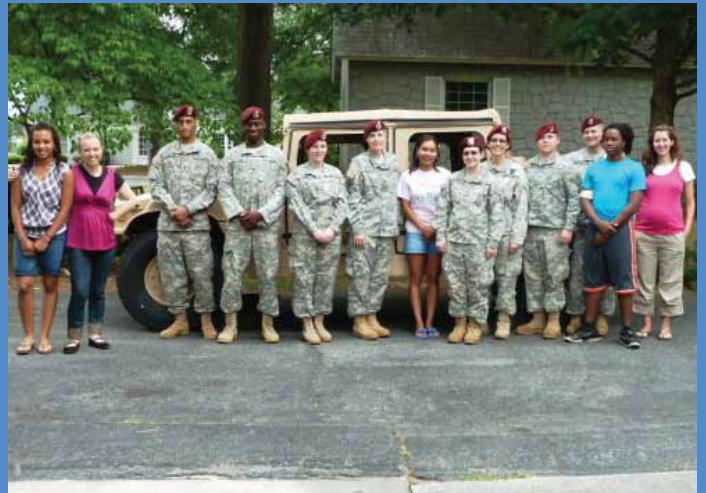
Members of the 360th Army Division of Fort Jackson, SC visit campus.