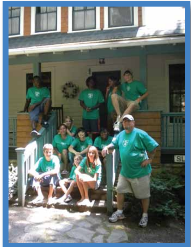
2011 Montreat Youth Conference

Our children and youth have many opportunities for Christian growth this summer. They will be presented the gospel in many ways and will have the opportunity to be the “Signal” to others of the love of God.